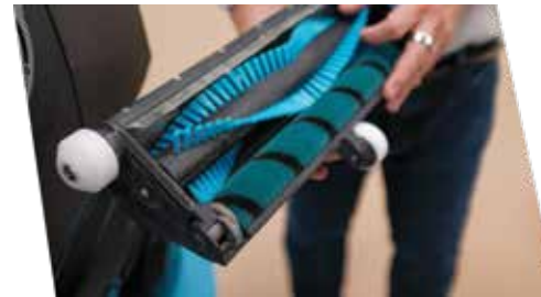
Easy to Swap Floor Tool

The R3 Vac is not just easy to use, but also to maintain. Featuring magnetic designs that require no tools for dismantling, you get full accessibility to key areas for maintenance.