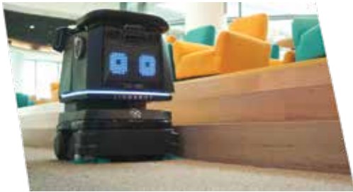
Up to 0cm Edge Cleaning.

With its compact size and professional-grade cleaning mechanisms, the R3 Vac delivers the best clean possible- carpet or hard floors.