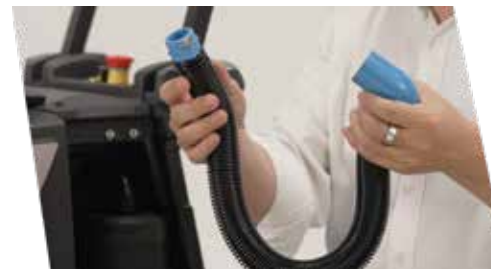
Removable Vacuum Hose