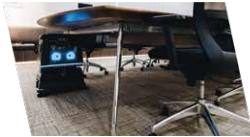
70cm And Under Tables.