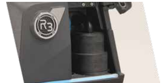
Easy Access Vacuum Motor