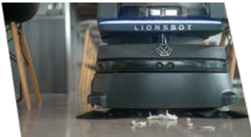
Single Pass Floor Tool.